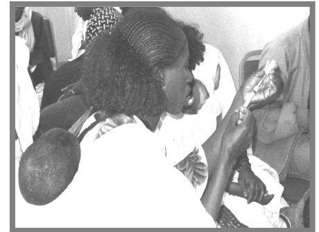
Community-based reproductive health agent, Tigray, Ethiopia

We analyzed data from the 1062 women enrolled in the study. Forty-one percent received services from HEWs, and 59% from CBRHAs. Among clients served, slightly more unmarried and illiterate women were able to access CBRHAs